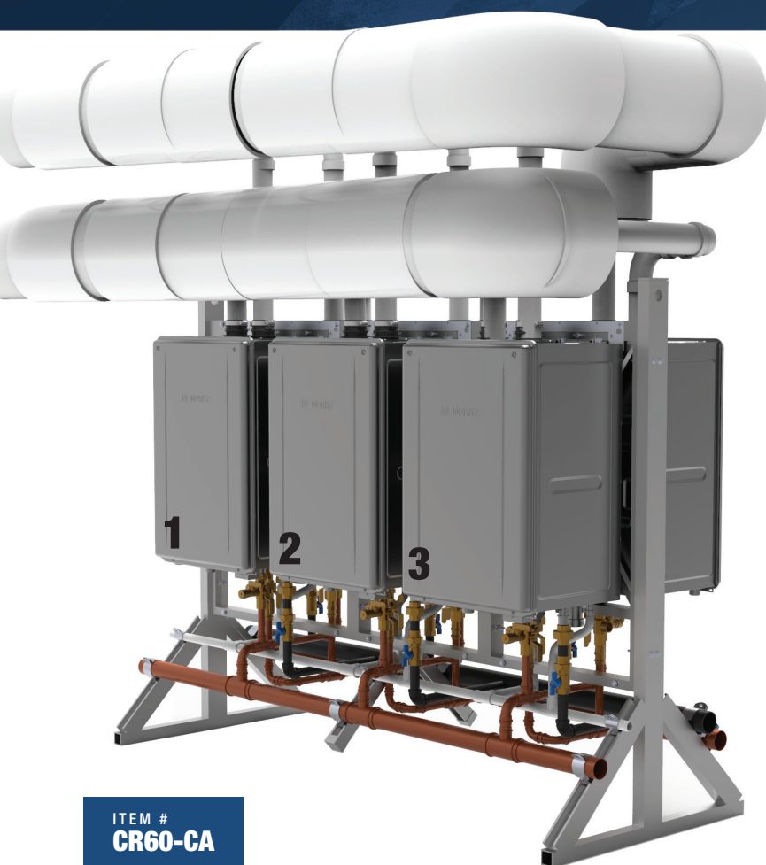
ITEM # CR60-CA